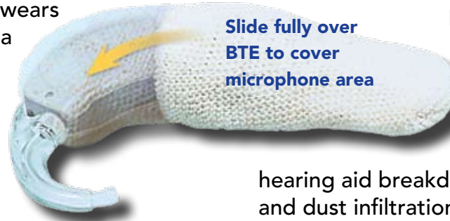
Slide fully over BTE to cover microphone area

Controls can be easily operated even with the HEARING AID SWEAT BAND™ in place. The protective covering simply slips over the hearing aid, no need for an application or special tools.